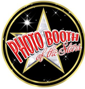
PHOTO BOOTH OF THE STARS