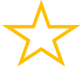
Photo Strip Upgrade (choices 2, 3, and 4 shown on page 2): $100 _____